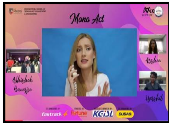
Mono Act participants