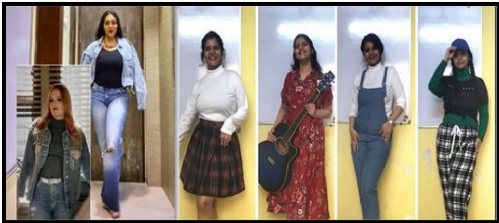
Students participating in Fashion Show