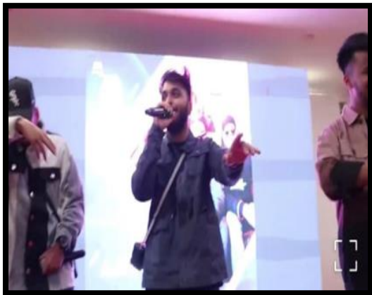
Band Performance by the guest