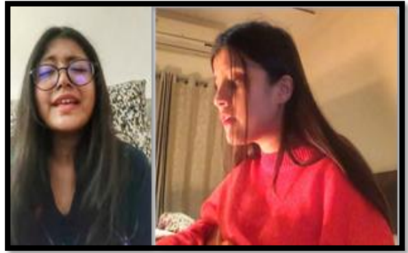
Raise the Mic event