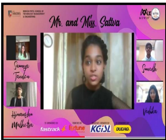
Students participated in Mr. and Ms. Sattva