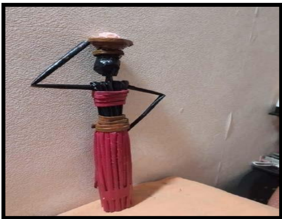
Make it Wow