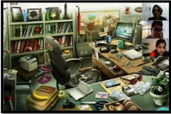
Mind Matrix event