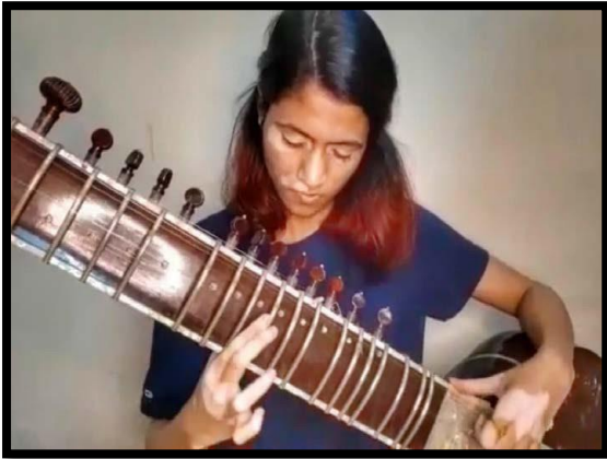
Student playing the instrument