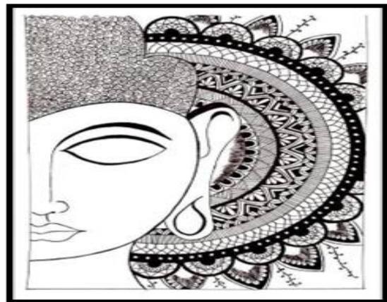
Paint it Black